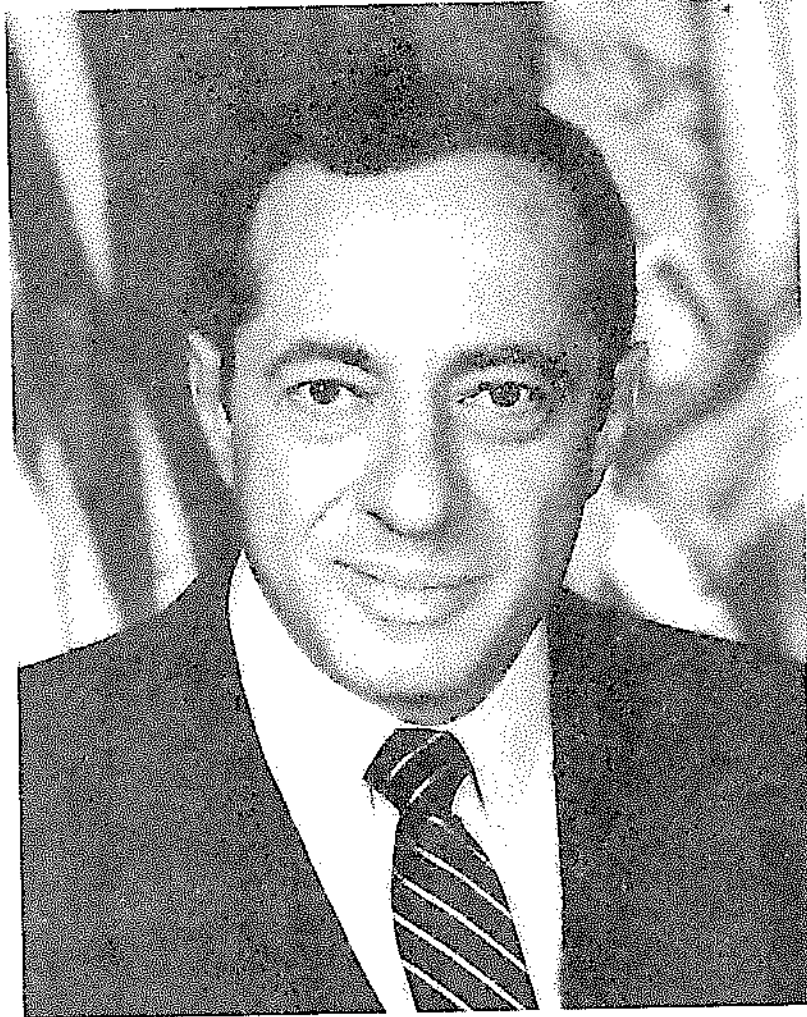
Mario M. Cuomo, Governor